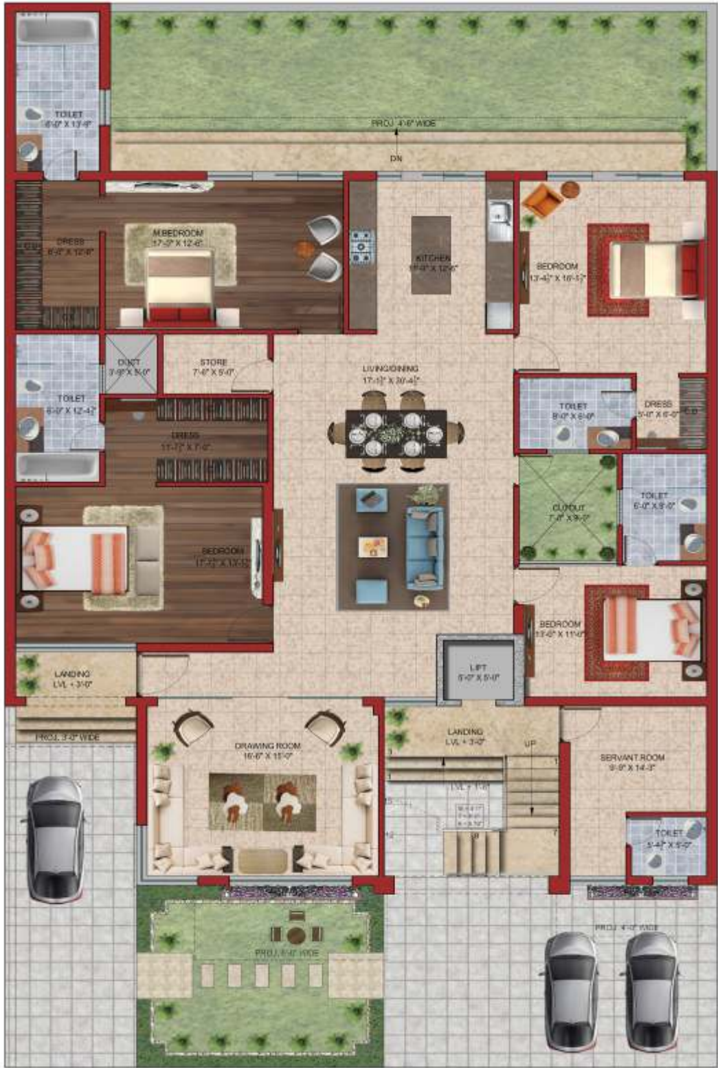
GROUND FLOOR LAYOUT-1