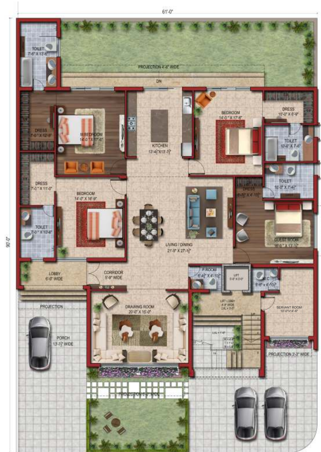
GROUND FLOOR LAYOUT-2